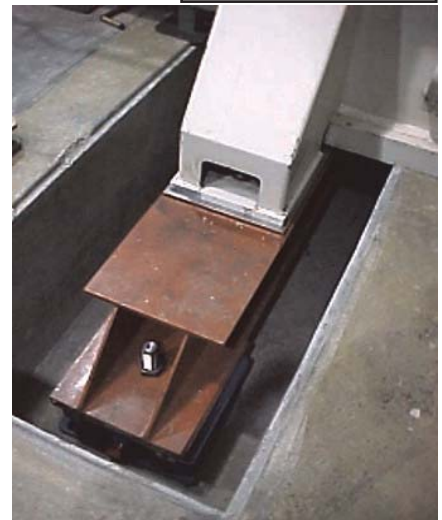
Close-up of an isolator and outrigger beam under a press foot.